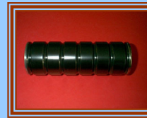
Multi-Groove Guide Roll