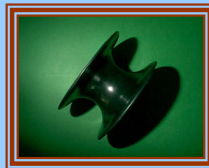
Strander Guide Pulley