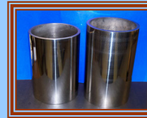
Samp Annealer Contact Rolls