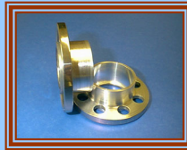
Niehoff-Endex Deflector Wheel

Parkway-Kew Corporation can rebuild worn or manufacture new extreme wear parts for your copper and other non-ferrous wire drawing, packaging and insulating equipment applications. Other in house capabilities include: CNC machining, milling, welding, grinding, and polishing, in addition to roll, shaft and journal restoration.