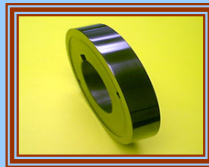
Syncro F-13/FX Draw Ring