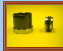
Die & Casting Rolls